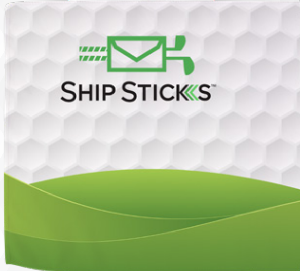
SHOWN WITH ART CODE: A396

Item Size: 7 1/4" L x 4 3/4" W x 14" H; Shoe Bag Imprint Area: 4 1/2"W x 6"H; Golf Towel Imprint Area: 24"W x 12"H Setup: $80(G); Production time: 7-10 Business Days