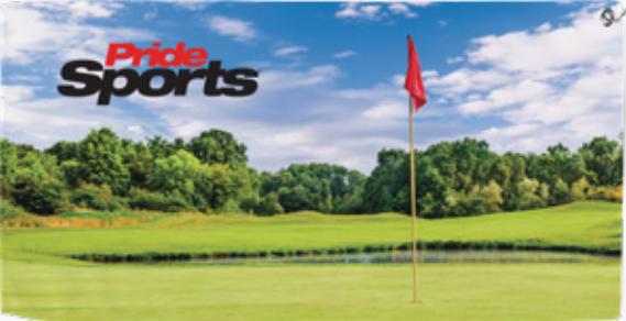
SHOWN WITH ART CODE: A394