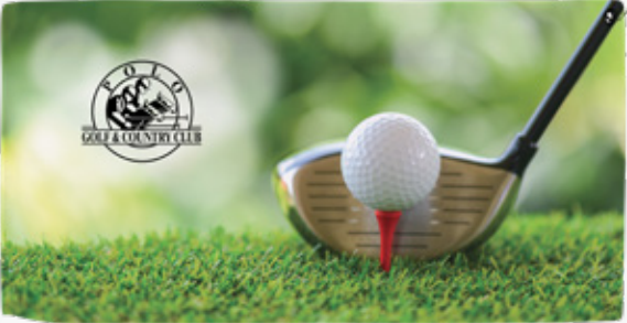
SHOWN WITH ART CODE: A395