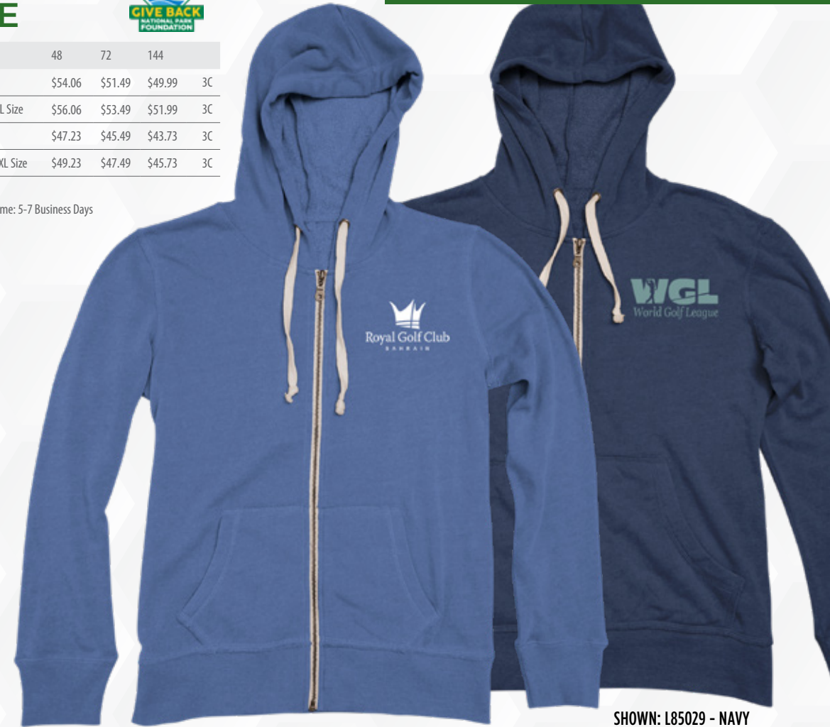
SHOWN: L85025 - BLUE YONDER