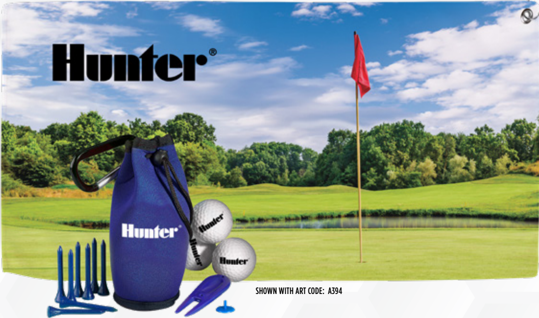
SHOWN WITH ART CODE: A394

Item Size: 2 3/4"W x 6 1/4" H; Imprint Area: 3 1/4"W x 2 3/4" H Setup: $125(G); Production time: 7-10 Business Days Color Options: Red, Green, Blue