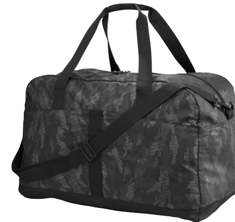
NE902 NORTH END ROTATE REFLECTIVE DUFFEL BETTER