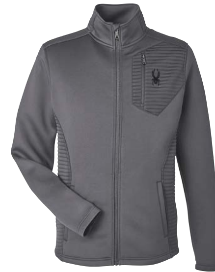
S16539 prime SPYDER MEN'S VENOM FULL-ZIP JACKET BEST