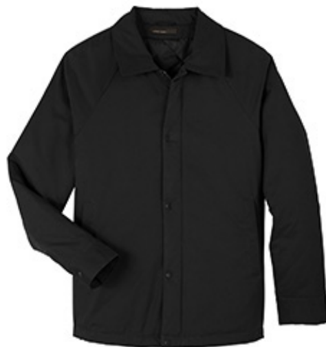
NE720 new NORTH END ADULT APEX COACH JACKET BETTER