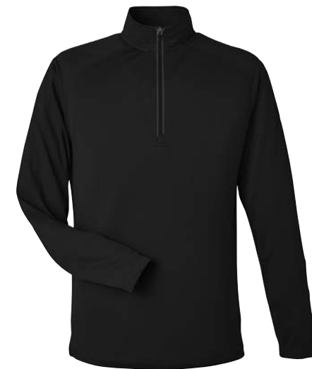
S16797 SPYDER MEN'S FREESTYLE HALF-ZIP PULLOVER BEST