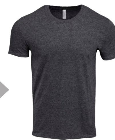
102A primeplus THREADFAST APPAREL UNISEX TRIBLEND SHORT-SLEEVE T-SHIRT BETTER