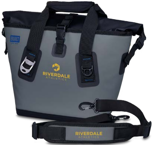
BT500 BUILT® WELDED COOLER SMALL ARCTIC ICE BEST