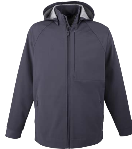
NE718 new NORTH END MEN'S CITY HYBRID SHELL GOOD