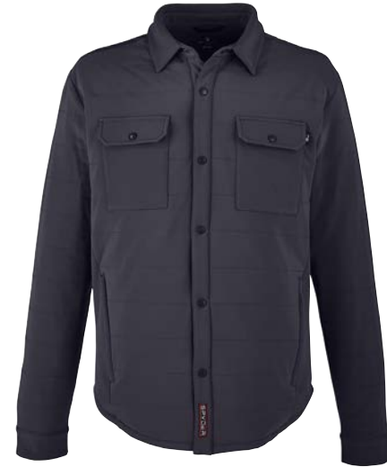
S17030 new SPYDER TRANSIT SHIRT JACKET BETTER