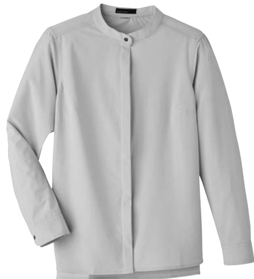
NE500W new NORTH END LADIES' BOROUGH STRETCH PERFORMANCE SHIRT BETTER

Some companies are actually thriving because of dramatic shifts in consumer behavior. In-home workout equipment companies report growth up as much as 66%, communication video conferencing reporting 300M participants per day. The video game industry is growing so fast that some believe it will reach over $300 billion by 2025.