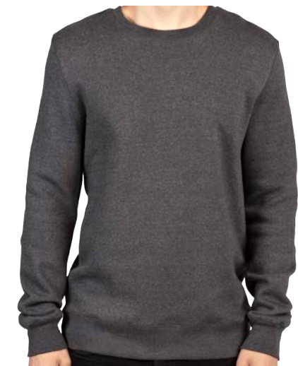
320C THREADFAST APPAREL UNISEX ULTIMATE CREWNECK SWEATSHIRT GOOD

The United States averages 20 technology companies founded per year that reach $100 million in revenues.