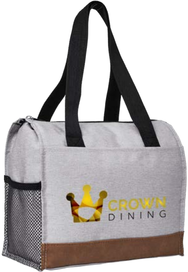
LB510 ASHER 12-CAN COOLER TOTE BETTER