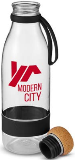
MG874 22 OZ. RESTORE TRITAN™ WATER BOTTLE WITH CORK LID GOOD