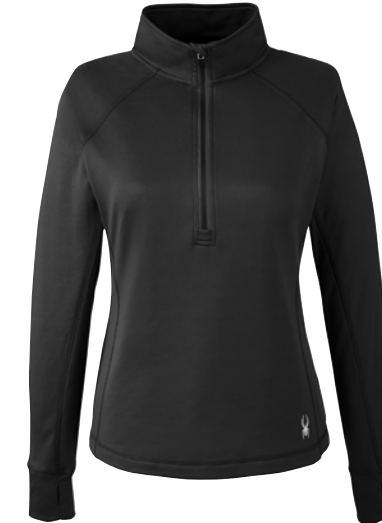
S16798 SPYDER LADIES' FREESTYLE HALF-ZIP PULLOVER BEST