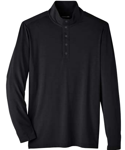
NE400 NORTH END MEN'S JAQ SNAP-UP STRETCH PERFORMANCE PULLOVER BETTER