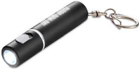
KC315 LIGHT-UP-YOUR-LOGO KEY LIGHT GOOD