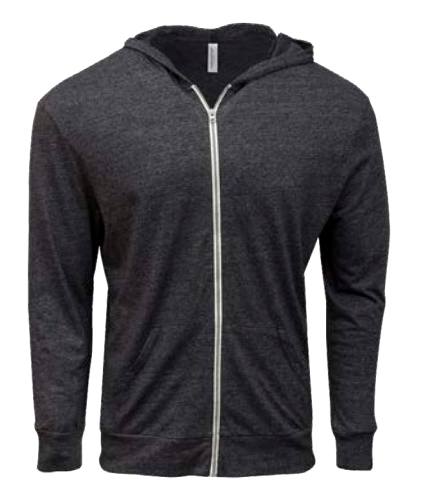
302Z THREADFAST APPAREL UNISEX TRIBLEND FULL-ZIP LIGHT HOODIE GOOD