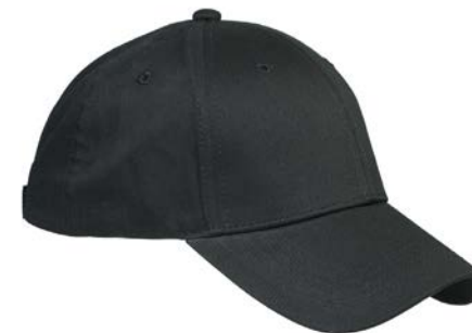
BX020 BIG ACCESSORIES 6-PANEL STRUCTURED TWILL CAP GOOD