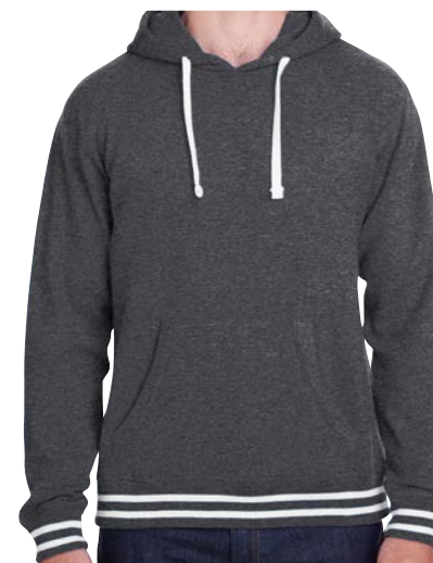
JA8649 new J AMERICA ADULT RELAY HOODED SWEATSHIRT GOOD