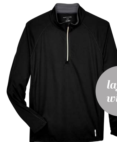
88187 prime NORTH END MEN'S RADAR QUARTER-ZIP PERFORMANCE LONG-SLEEVE TOP BETTER