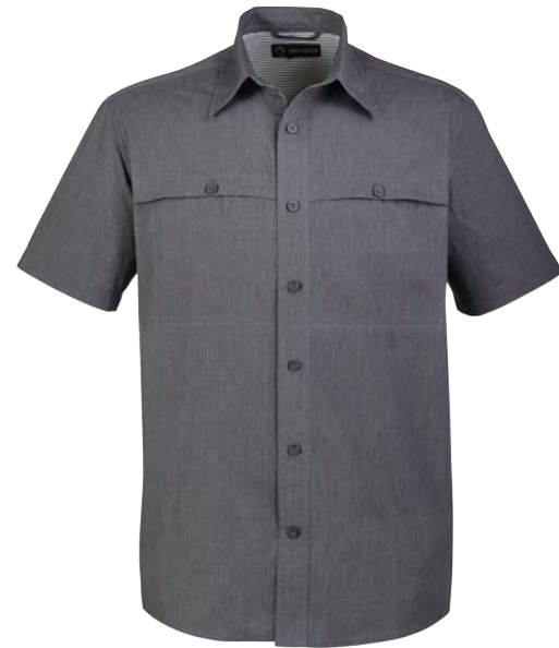
4435DD new ROCKHILL SHORT SLEEVE BREATHABLE WOVEN BEST