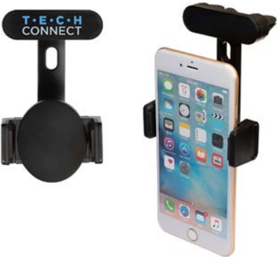
IT310 ROADSTER CAR VENT WIRELESS CHARGER BETTER