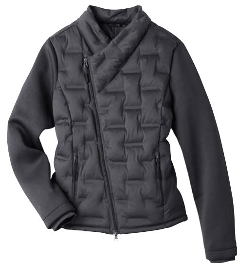
NE710W new NORTH END LADIES' LOFT PIONEER HYBRID BOMBER JACKET BETTER