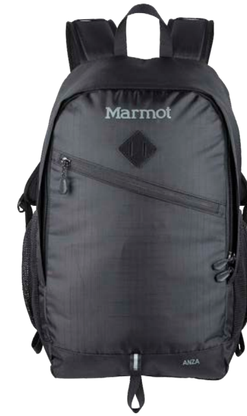
23860 MARMOT ANZA BACKPACK BEST

The U.S. is the largest tech market in the world, coming in at $1.6 trillion in 2019.