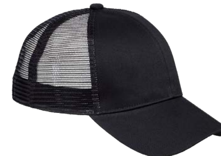
BX019 BIG ACCESSORIES 6-PANEL STRUCTURED TRUCKER CAP GOOD