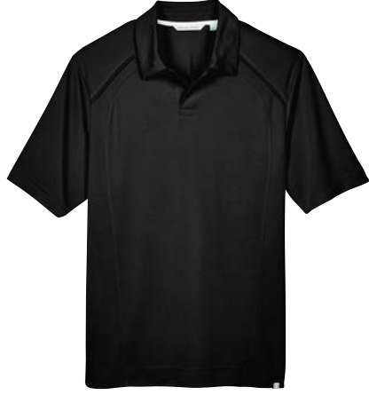
88632 prime NORTH END MEN'S RECYCLED POLYESTER PERFORMANCE PIQUÉ POLO BETTER