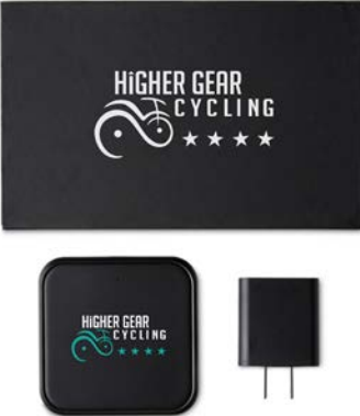
IT139 FAST CHARGING WIRELESS CHARGING SET BEST