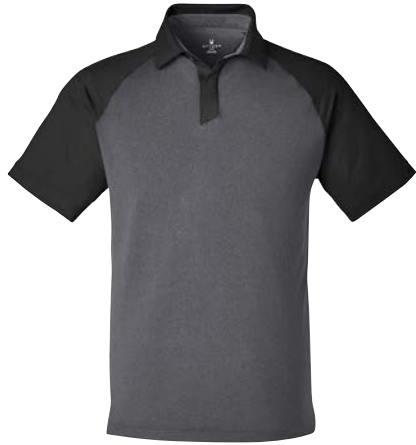
S16533 new SPYDER MEN'S PEAK POLO BEST