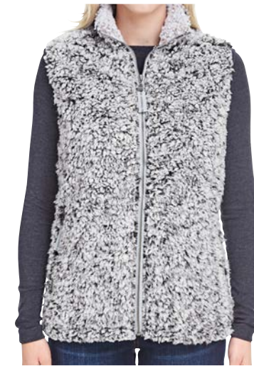
JA8456 primeplus J AMERICA LADIES' EPIC SHERPA VEST GOOD