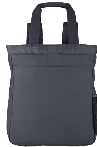
NE901 NORTH END REFLECTIVE CONVERTIBLE BACKPACK TOTE BETTER