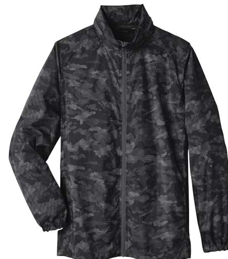
NE711 NORTH END MEN'S ROTATE REFLECTIVE JACKET GOOD