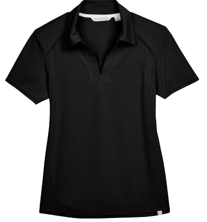
78632 prime NORTH END LADIES' RECYCLED POLYESTER PERFORMANCE PIQUÉ POLO BETTER