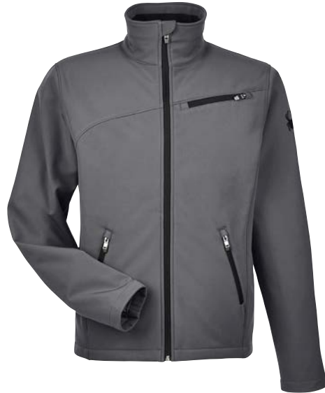
187334 primeplus SPYDER MEN'S TRANSPORT SOFT SHELL JACKET BEST

1 in 3 workers would rather have a casual dress code than an extra $5,000 in pay.