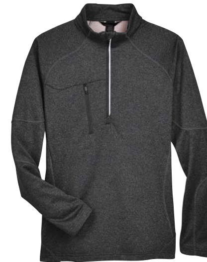
88175 primeplus NORTH END ADULT CATALYST PERFORMANCE FLEECE QUARTER-ZIP BETTER