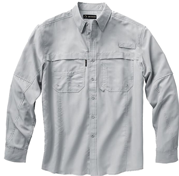
DD4405 primeplus DRI DUCK 100% POLYESTER LONG-SLEEVE FISHING SHIRT BEST