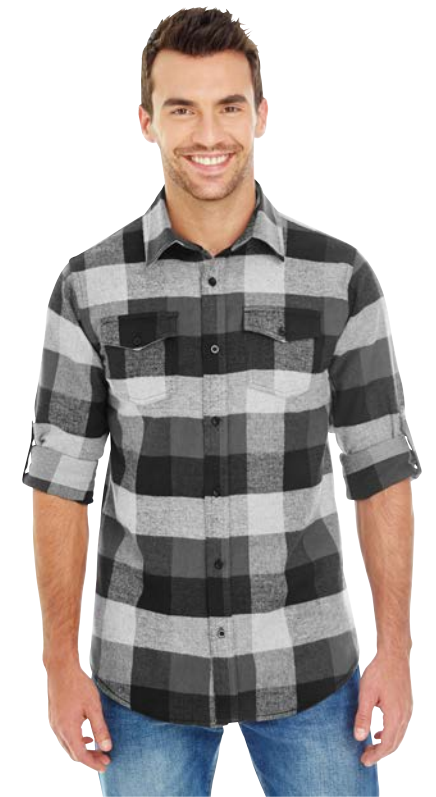
B8210 primeplus BURNSIDE MEN'S PLAID FLANNEL SHIRT GOOD