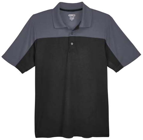
CE101 CORE 365 MEN'S BALANCE COLORBLOCK PERFORMANCE PIQUÉ POLO GOOD