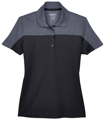
CE101W prime CORE 365 LADIES' BALANCE COLORBLOCK PERFORMANCE PIQUÉ POLO GOOD

In 2015, startups created over 2 million jobs in the U.S. alone.