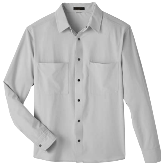
NE500 new NORTH END MEN'S BOROUGH STRETCH PERFORMANCE SHIRT BETTER