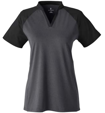
S16564 SPYDER LADIES' PEAK POLO BEST